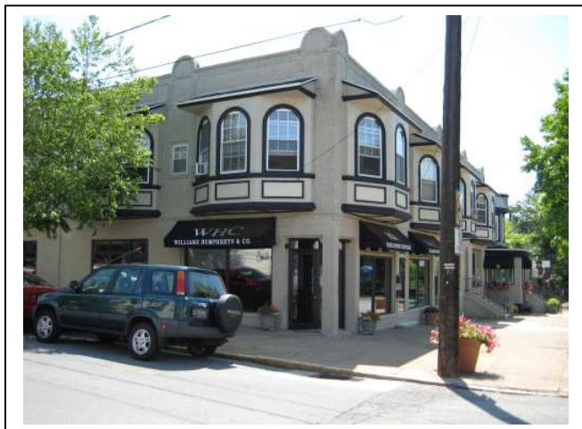
Entire Corner Retail Store (1825 Delaware on far left)

Trolley Square - located in the center of a vibrant neighborhood, Trolley Square offers fine, tax-free shopping. There are over 80 shops, restaurants, and professional services. The Village of Trolley Square is an unusual urban oasis that has witnessed the growth of many art galleries, specialty shops, restaurants, pubs and services. This area is truly one of Delaware's most unique neighborhoods.