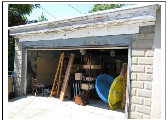
Rear 2-Car Garage